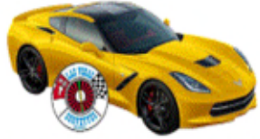
Enjoying the Corvette Dream in 2016